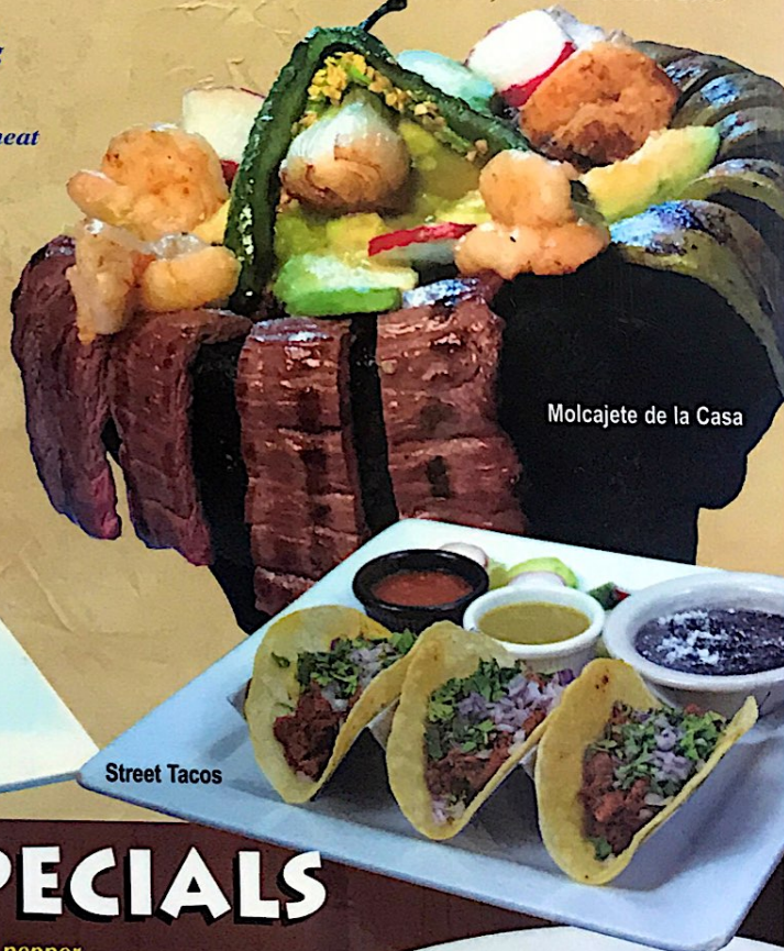
Molcajete de la Casa

Grilled chicken strips, steak, shrimp, bell pepper, onion, and tomato, covered w/ tomatillo salsa and cheese sauce presented in an authentic Mexican stone bowl. Served on the side a guacamole salad, tortillas, rice & beans. 28.99