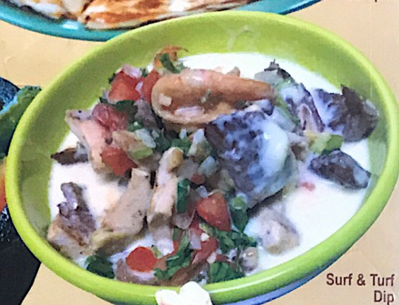
Surf & Turf Dip