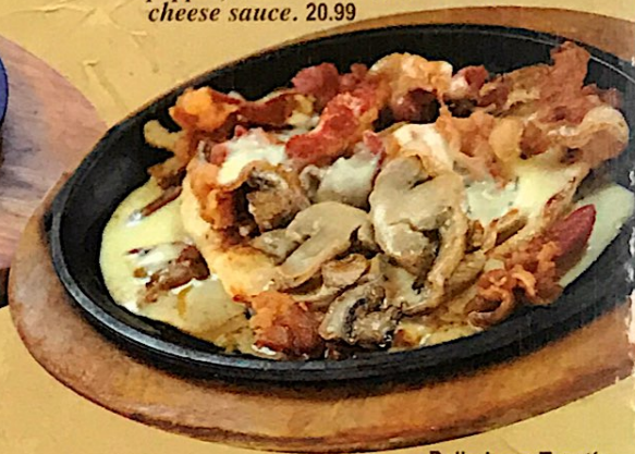
Pollo Loco Tapatio

12oz. grilled boneless chicken breast and shrimp with sautéed onion, bell pepper, and tomato covered with cheese sauce. 20.99