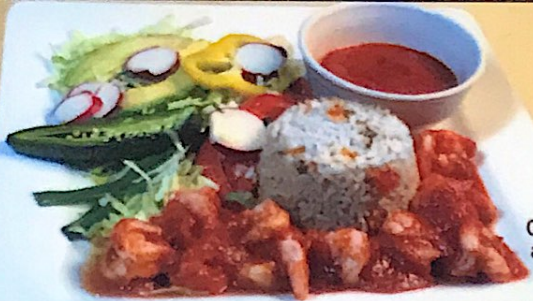
Camarones a la Diabla