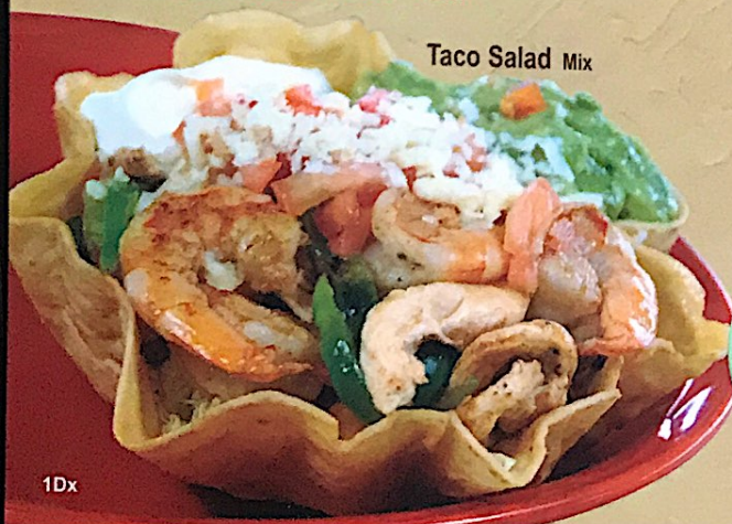
Taco Salad Mix

Mixed romaine and iceberg lettuce, tomato, onion & avocado, topped with crab, scallops & shrimp & shredded cheese 12.99