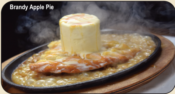
Brandy Apple Pie