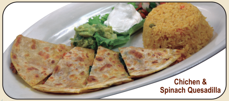
Chicken & Spinach Quesadilla

12oz. grilled boneless chicken breast with sautéed onion, bell pepper & mushroom, topped with cheddar jack cheese. 22