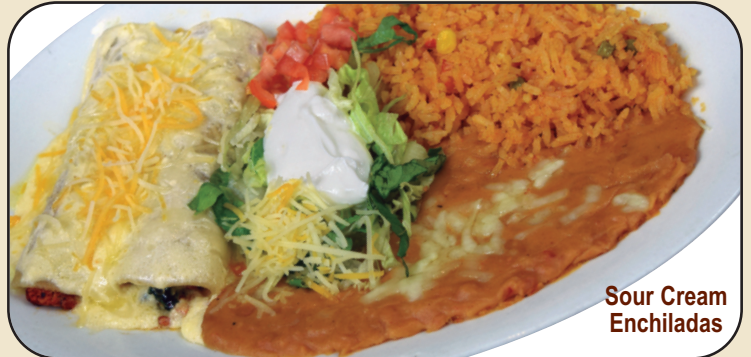
Sour Cream Enchiladas

CHIMICHANGA BALBOA Stuffed flour tortilla with steak, grilled chicken, & shrimp, deep fried to a golden brown & topped w/ cheese sauce. Served with lettuce, sour cream, guacamole, pico de gallo, rice & beans. 18